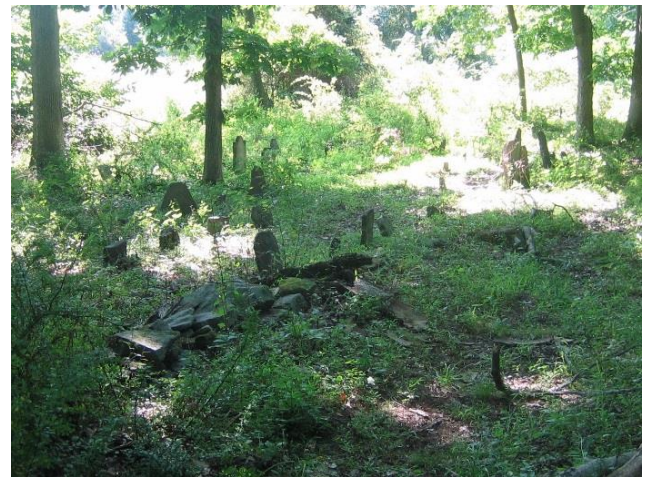
The Howell/Rittenhouse Graveyard in summer