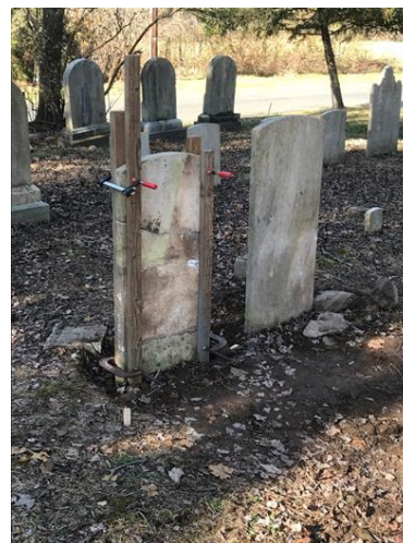
Stone broken in three pieces repaired at Slacktown cemetery in Kingwood Township