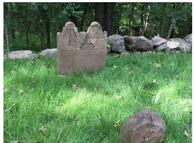
Figure 2: Restored with footstone

Alas how chang'd those lovely flowrs, Which bloomed and cheered our harts; Fair fleeting comfort of an hour How soon we are called to part."