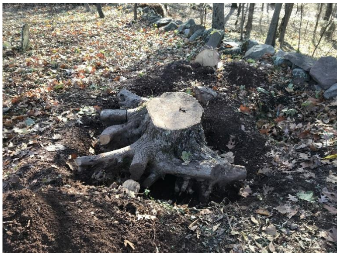
Figure 4: Removing stump was a challenge

The task of removing the tree and restoring the gravestones facing Dave was monumental. The first step was removing the fallen tree was accomplished in 2016 by Chris Olenek, a volunteer and professional arborist. The remaining gigantic stump was dug out and removed in November 2017. In May of this year Dave together with Peter and Dylan Nace finished the restoration. They filled in the depression left by the stump removal, found several fragments of the head stone, reset it and the footstone, and planted grass over the grave as shown in figure 2.