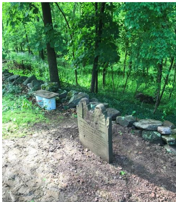
Figure 6: Headstone reset