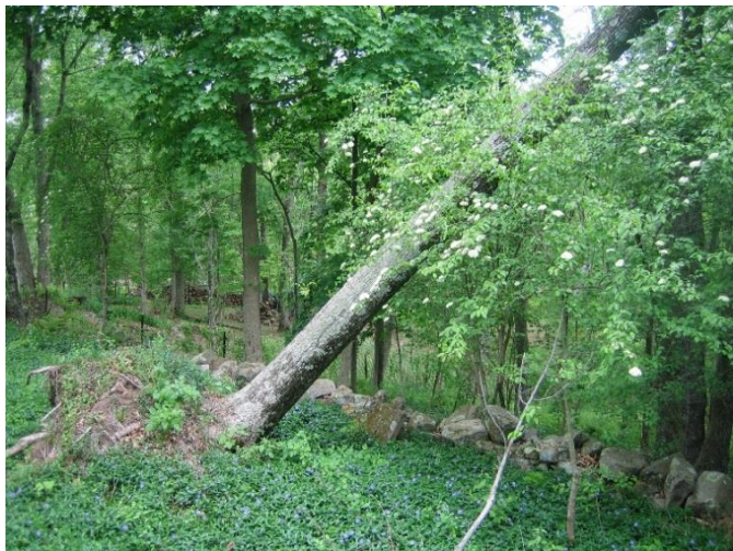
Figure 3: Fallen tree threatens graves

The task of removing the tree and restoring the gravestones facing Dave was monumental. The first step was removing the fallen tree was accomplished in 2016 by Chris Olenek, a volunteer and professional arborist. The remaining gigantic stump was dug out and removed in November 2017. In May of this year Dave together with Peter and Dylan Nace finished the restoration. They filled in the depression left by the stump removal, found several fragments of the head stone, reset it and the footstone, and planted grass over the grave as shown in figure 2.